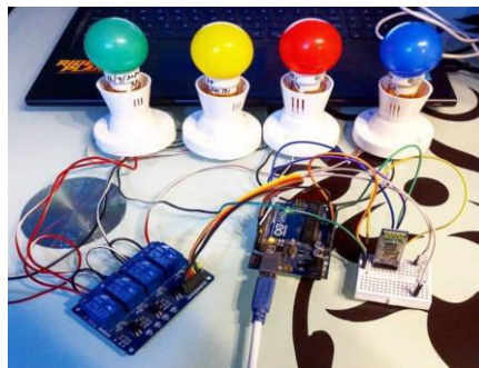
Fig 2. Experimental setup

In this system, by detecting hand gestures through a camera, OpenCV can translate them into commands that can be sent to an Arduino board. The Arduino board, in turn, can activate the corresponding appliances.